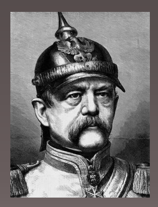
Otto von Bismarck