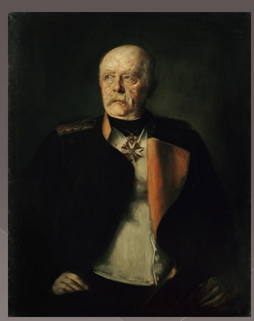
Otto von Bismark

Bismarck then resolved the only way to quash the liberals was to gain the populace's support of the monarchy and army. He would do this through the expansion of Prussian Nationalism.