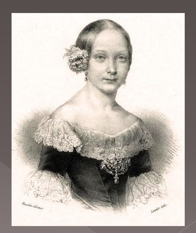
Isabelle II of Spain